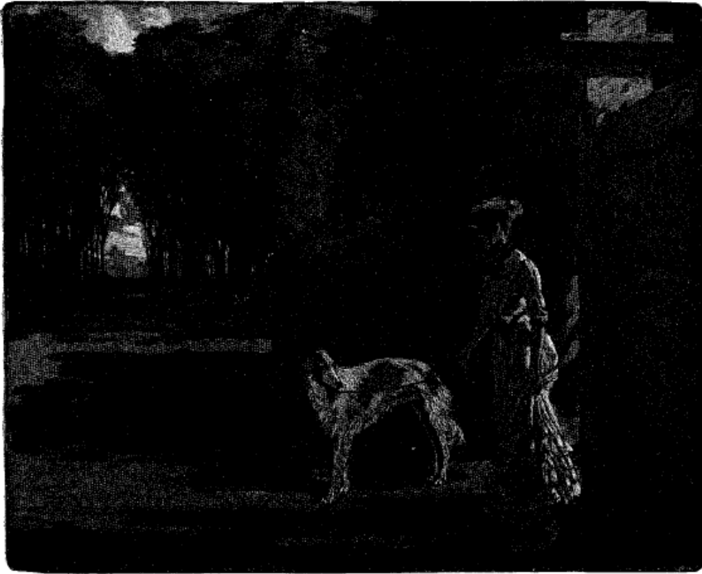
So about that time he got me Artaxerxes for a chaperone.

papa began to object. A good many times when I've been sitting on the edge of the road swinging my feet over the Powasket, watching the last color going out beyond Canada, and listening to the owls and frogs and things, he has come to meet me and grumbled about 'going to extremes.' But I had him, you see, and only laughed. Hadn't he trained me to it?